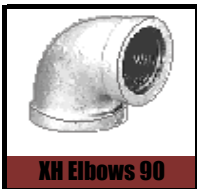
XH Elbows 90