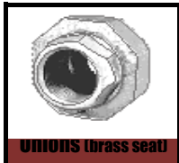
UNIONS brass seat