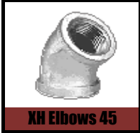
XH Elbows 45