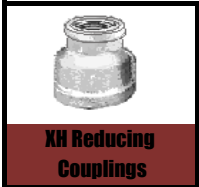
XH Reducing Couplings