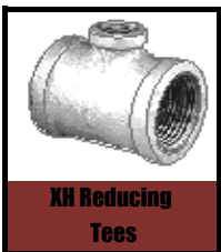
XH Reducing Tees