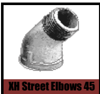
XH Street Elbows 45