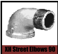
XH Street Elbows 90